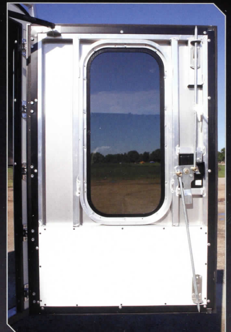
The lower inner door panel protects the outer door panel from damage caused by shifting cargo.