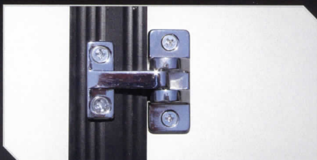
The marine grade chrome steel hinges used on all full back doors provide superior strength and durability.