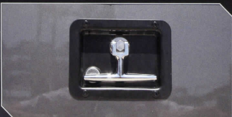
The folding T handles have OEM automotive grade Strattec Key cylinders for long life and trouble free operation.