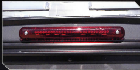
The sealed LED brake light ensures maximum visibility and trouble free operation.